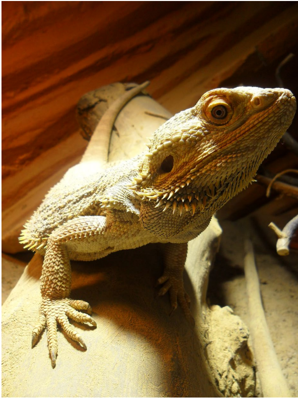
FIGURE 2 Bearded dragon ( Pogona vitticeps )

of the phages used in the present study on Salmonella stands in contrast with study results from swine and poultry (Adhikari et al., 2017; Fiorentin et al., 2005; Lim et al., 2011; Zhang et al., 2015). For example, Gebru et al. (2010) used food additive anti- Salmonella Typhimurium bacteriophages in pigs and reduced Salmonella shedding significantly.