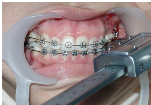
Figure 6: Intra-oral usage of a digital calliper

Data for the evaluation of each intervention were collected by direct intra-oral measurements. The measurement was taken from the canine cusp tip to the mesiobuccal cusp tip of the maxillary 1st molar using digital intra-oral calliper (Figure 6). Measurements were taken immediately before the beginning of canine retraction and every two weeks along three months following.