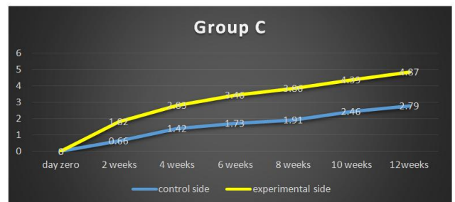
Figure 9: Graphic representation of the mean distance travelled by the maxillary canine in reference to the baseline in group C

According to Thiruvengkatachari et al. (19) and Aboul-Ela et al., [7], titanium mini-screws provided a simple, efficient anchorage for canine retraction. Direct anchorage during canine retraction using mini-screw placed between 2 nd premolar and 1 st permanent molar was chosen to eliminate any molar anchorage loss which may give misleading results during measurements.