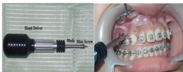
Figure 3: The used MOPs tool

Micro-osteoperforation tool: The aim was to create multiple pores with a certain depth (range from 3:7mm) in the alveolar bone. So, Mini-screws were used with a 1.6mm diameter and 8mm length to perform the intended perforations. That when the length of mini-screw is 8mm, and the gingival thickness is 2mm, the efficient depth of perforation in the alveolar bone will equal 6mm (Figure 3).