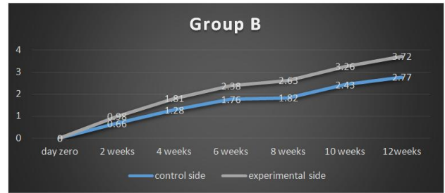
Figure 8: Graphic representation of the mean distance travelled by the maxillary canine about the baseline in group B

Table 3 and Figure 9 show the independent sample t-test for the mean distance travelled by the maxillary canine on both the control and the experimental (MOPs) sides indicating the highly significant difference.