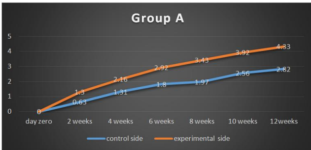
Figure 7: Graphic representation of the mean distance travelled by the maxillary canine about the baseline in group A

Table 1 and Figure 7 show the independent sample t-test for the mean distance travelled by the maxillary canine on both the control and the experimental (MOPs) sides indicating the highly significant difference.