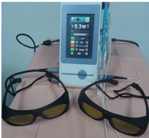
Figure 4: Laser device and the protective eyeglasses

The soft laser was applied using a laser machine ( DenLase-810/7 ) (Figure 4) with the following specifications; Dimensions (W x H x D): 130 x 190 x 180 mm, Weight: approx. 1.5 kg, Display: LCD Touch Screen, Cooling: air-cooling, Wavelength: 810 \pm 10 nm, Output power: 0.5 \text{ W/cm}^2 , Operation modes: continuous wave (CW).