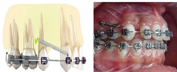
Figure 1: Lateral view of coil spring attached to canine hook and mini-screw

the beginning of orthodontic treatment till finishing the phase of levelling and alignment. Mini-screws were inserted between 1st molar and 2nd premolar which was used directly for canine retraction. Ligaturing of the upper incisors together by a ligature wire was taken into consideration.