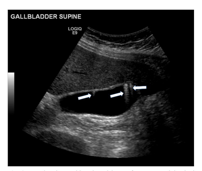
Fig. 2 Pseudopolyps. This selected image from a transabdominal ultrasound scan demonstrates three separate pseudopolyps. Note the reverberation or "comet-tail" artefact posterior to the lesions ( arrows )

The evidence of 10 mm as a cut-off value for cholecystectomy is of moderate quality at best. This is due to a combination of lack of randomised controlled trial data, mainly retrospective studies and, in most cases, an arbitrary cut-off of 10 mm. In addition, because of the relatively low prevalence of gallbladder cancer, power calculation (an indication of the minimum number of subjects that need to be enrolled in a study to have