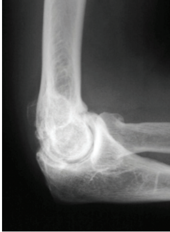
FIGURE 1: Lateral radiograph demonstrates idiopathic arthritis with osteophytes on the radial head as well as anterior and posterior ulnohumeral joints.

pain and crepitus exacerbated during rotation of the forearm rather than flexion and extension. Conversely, malunion of distal humerus or olecranon fractures which extend intra-articularly into the ulnohumeral joint typically result in arthritis which is symptomatic during flexion and extension.