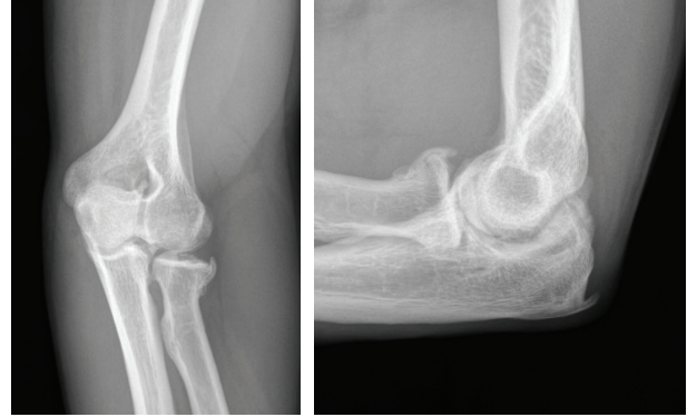
FIGURE 2: Oblique and lateral radiographs of a patient who sustained a radial head fracture treated nonoperatively; this patient later developed lateral elbow pain with forearm rotation. Radiographs demonstrate anterolateral osteophytes noted at the radial head and decreased joint space in the radiocapitellar joint.

For patients who report a prior episode of significant elbow trauma, the details surrounding the initial injury as well as mechanism of trauma are important aspects of the history, as any previous treatments including operative reports from previous surgeries and therapy reports to elicit