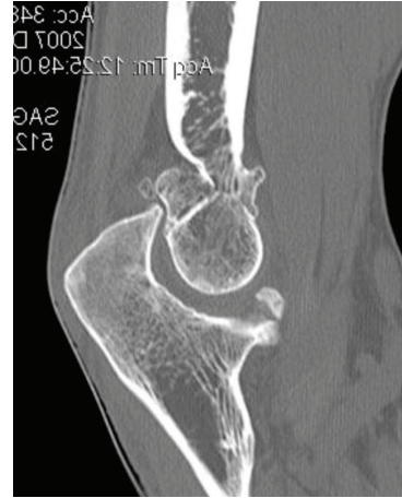
FIGURE 3: Sagittal CT image demonstrating osteophytes within the olecranon and coronoid fossae of the distal humerus.

Computerized tomography (CT) is frequently useful, especially when HO or intra-articular loose bodies are suspected, or if bony deformity or malunion is suspected in the setting of previous fracture. CT reconstruction is typically helpful in further delineating bony and articular anatomy (Figure 3). Advanced imaging is important in documenting ulnohumeral joint congruency as well as any osseous impingement secondary to overgrowth in the olecranon or coronoid fossae that would directly serve to limit motion. Magnetic resonance imaging (MRI) has a very limited role except to potentially workup subtle posttraumatic instability.