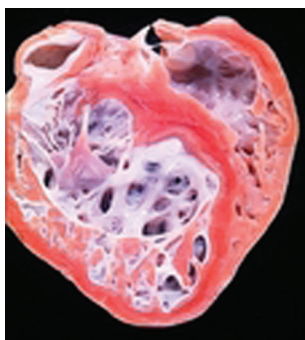
Figure 1 - Gross aspect of the explanted heart, showing the characteristic non-compaction involving the inlet and apical portion of the left ventricle but sparing the ventricular septum.

The pathology analysis of the explanted heart revealed ventricles with prominent ventricular trabeculation and deep recesses, involving the inlet and the apical portion. The compact myocardium was thin (3mm) and endocardium showed diffuse thickening. The ratio of thickness of noncompacted-to-compacted myocardium was 3.3. The septum was 8 mm thick and there was myocardial hypertrophy, consistent with the diagnosis of dilated cardiomyopathy with isolated noncompaction of the left ventricular myocardium or “spongy myocardium” (Figure 1). Microscopically, the deep recesses were lined by a thickened endocardial layer and the myocardial fibers showed mild hypertrophy (Figure 2). No inflammatory infiltrate was detected.