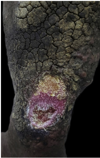
Figure 2 Left leg ulcer before treatment.