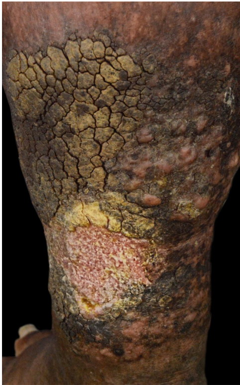
Figure 3 Complete healing of the left leg ulcer after two months of treatment.

Treatment was initiated with the use of a vitamin B complex and oral folic acid, in addition to maintaining daily dressings.