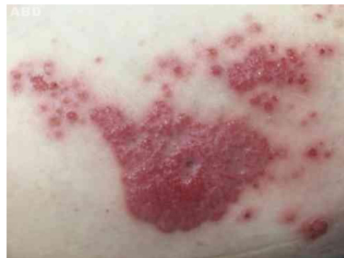
Fig. 1 Vegetating plaque and erythematous and pinkish papules grouped in the lateral region of the right thigh.

Histopathology assessment is necessary for diagnostic confirmation, the eccrine ducts may or may not be demonstrated. Immunohistochemistry can help in difficult cases, with cells often positive for keratin 6 and 19, as well as filaggrin. 2