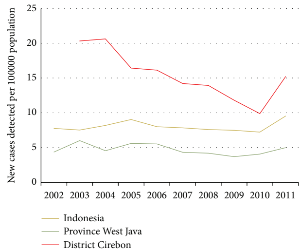
FIGURE 1: 10-year trend of new case detection rate in Indonesia, West Java and Cirebon in 2002–2011 (data is merged from [21, 22]).

We will focus on the epidemiology of leprosy in Cirebon district, as this is the area of research for this study and put the numbers in the context of the provincial (West Java) and national figures. Last year, the District Health Office of Cirebon reported 320 new leprosy cases (15.2/100,000 population). As shown in Figure 1, the number of new leprosy cases on national level showed a flat pattern until 2010. Last year, the Ministry of Health of Indonesia reported 23,000 new leprosy cases (9.5/100,000 population); an increase of 35% compared to 2010. We are not aware of any recent changes in the leprosy services that can account for this increase. Part of the explanation for the increase at the national level could be increased case detection activities conducted by the