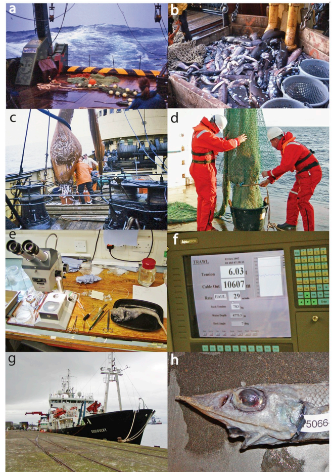
Fig. 1. Photographs of deep-sea collecting. a. Fishing deck in rough weather. b. Bag of deep-sea fishes. c. Emptying net on side trawler. d. Emptying bag on stern trawler. e. Dissection station at sea. f. Winch console, with 10,607 m of trawl wire out at depth of 4775 m. g. RRS Discovery at Fairlie, Scotland. h. Trachyrincus murrayi from the Goban Spur, depth 1360–1,240 m.

Bray et al. (1999) listed 19 'landmark papers' on deep-sea parasites, with three in the nineteenth century and only three in the first half of the twentieth century. The first report of an abyssal parasite was not until 1991 and the first use of molecular techniques 1993. The fact that abyssal plain parasites were only explored in the later twentieth century is explained by the expense and difficulty of collection of hosts at these depths. Collection from the upper bathyal can be considered an extension of commercial fishing and, indeed, several recent surveys have relied on by-catches of commercial fisheries ( Nacari and Oliva, 2016 ;