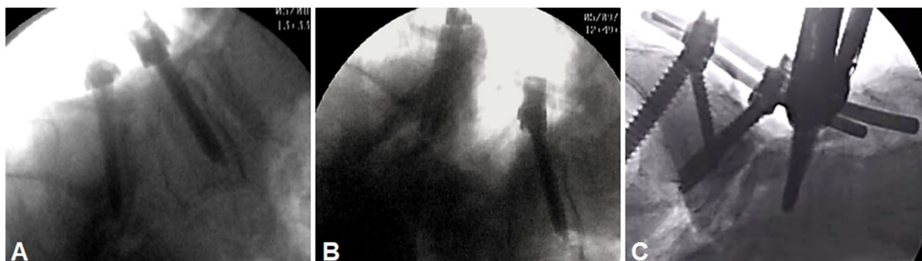
Fig. 1 A Standard posterior approach to the lumbosacral junction with screw placement. B A 100% slip was provoked at the lumbosacral junction. C Reposition was obtained through lumbosacral or lumbopelvic fixation