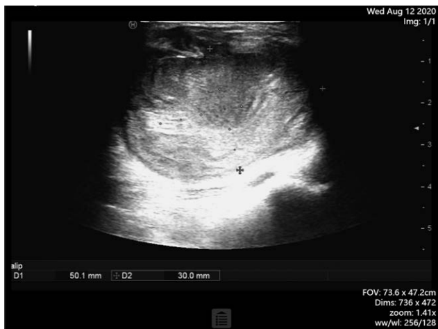
Figure 3. PSA had shrunk significantly, and no blood flow signal was detected a week later.

assist physicians in injecting medications into the PSA cavity rather than the arterial lumen. This gives a clinically applicable imaging approach that is real-time, safe, and effective.