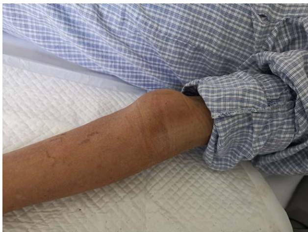
Figure 1. Giant psA of brachial artery caused by interventional puncture.

Three months before, the patient had undergone an interventional puncture to treat atherosclerotic occlusive disease in the lower extremities. The treatment, however, proved unsuccessful. The patient had no clear symptoms of self-consciousness, and the mass tended to grow. Taking into account the patient's medical history, physical examination, laboratory examination,