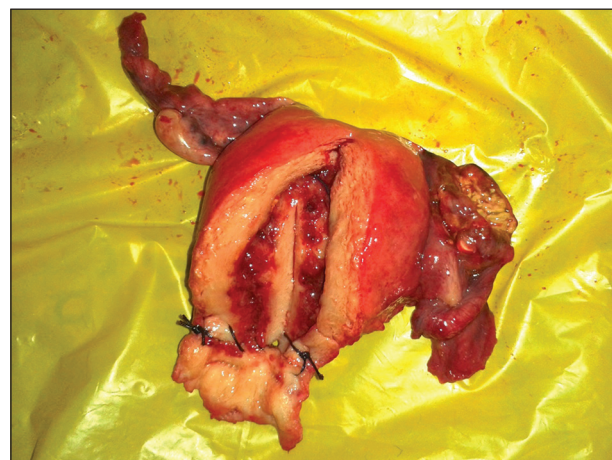
Figure 2: Hysterectomy specimen showing granuloma in right tube