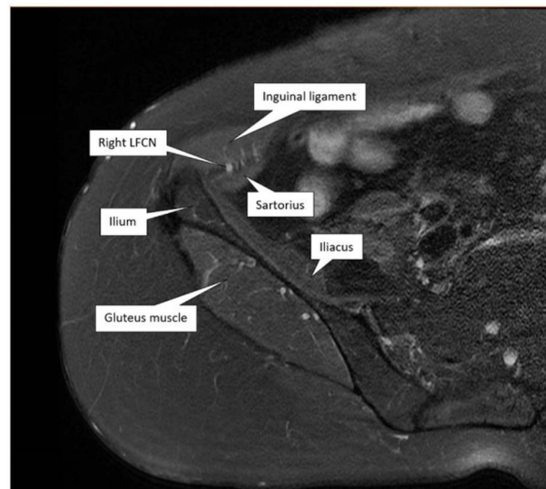
Figure 2. Axial T2 FS image shows mild focal swelling in the right LFCN underneath the inguinal ligament adjacent to the anterior superior iliac spine.

There are many causes of MP. Some mechanical causes include obesity, pregnancy, pelvic masses, wearing tight belts or trousers and orthopaedic procedures causing direct damage to the LFCN. Metabolic factors such as lead poisoning, alcoholism, diabetes mellitus and hypothyroidism are also associated with MP. In a series of 67 patients with MP, 10 patients (15%) had no associated condition, making idiopathic cause the second most frequent finding after obesity [2]. Although there was no apparent cause in our patient, the presence of focal swelling in the LFCN raises the possibility that recurrent microtrauma in her occupational role as a cook may have caused damage to the nerve pain fibres.