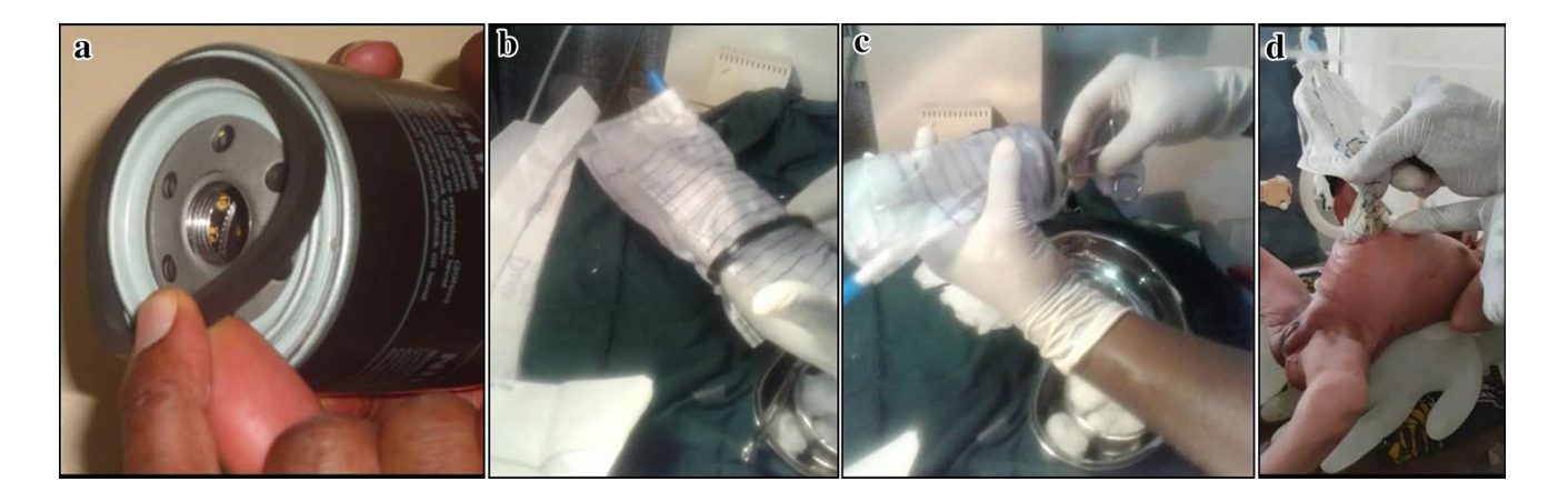
Fig. 1 a Rubber ring of automobile oil filter. b Cut end of urine bag fitted into the rubber ring. c Cut end of bag everted over the rubber ring and held in place by non-absorbable sutures to form the silo bag (Kano bag)

Following complete reduction of the bowel into the peritoneal cavity (Fig. 2), the abdominal wall is closed under