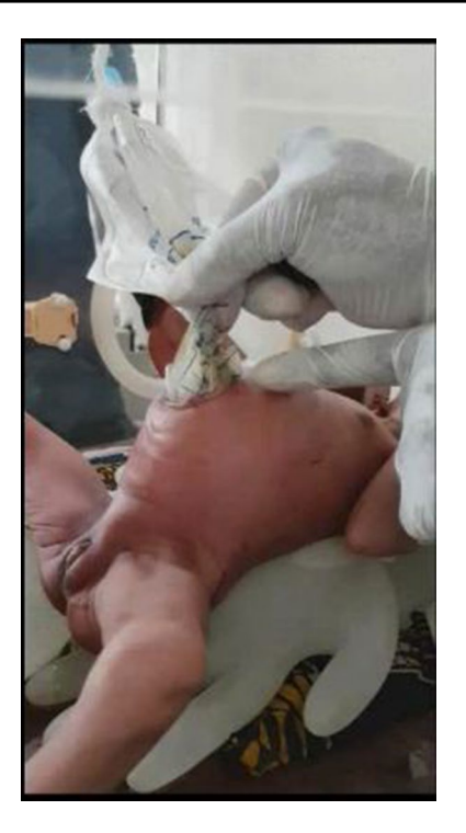
Fig. 2 Fashioned silo bag, clinical application and complete reduction of the bowel

local anaesthesia and sedation (muscle and fascia separate from skin) with non-absorbable sutures (Nylon 2/0) and dressed. The baby is returned to the incubator nil per os (NPO) with continuous nasogastric (NG) tube drainage and IV fluids. If by the second day post-closure, the NGtube aspirate has reduced significantly or the baby is passing stools, the baby is commenced on breast milk that is increased as tolerated.