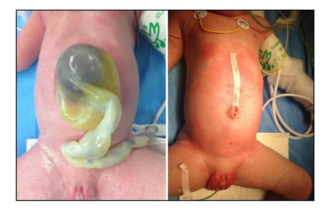
Fig. 5 Primary closure of moderate-sized omphalocele defect

A retrospective analysis of patients managed for an omphalocele in AKTH Kano between September 2011 and February 2017 showed that of the 40 patients whose records were analysed, 24 were males and 16 were females (M:F=1.5:1). Only one of the patients (2.5%) had an antenatal ultrasound scan detection of the anomaly. Of the 40 patients, 27 (67.5%) were born at home, while 13 (32.5%) were born in a health facility. There were two (5%) caesarean deliveries due to foetal distress. The majority (35/40; 87.5%) of the neonates had an omphalocele major. Six patients presented with a ruptured sac. These six patients had an operative treatment, with the placement of a sutured silo bag under general anaesthesia. All other patients with an intact sac had a non-operative treatment with the use of an escharotic agent (silver sulphadiazine cream) topically applied to the sac to induce epithelialization and create a ventral hernia (Fig. 6) which would be closed at a later date [15, 43, 47, 48, 52, 53]. Other parameters of the study patients are as depicted in Table 7.