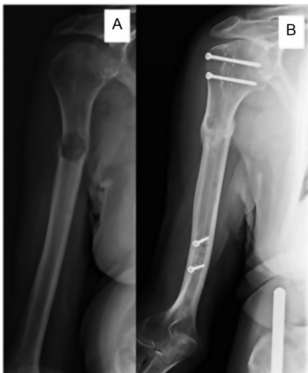
Figure 1 (A) An 86-year-old male with pathological fracture of the right humeral diaphysis from multiple myeloma treated with a long CFR-PEEK humeral nail. Postoperative radiotherapy 20 Gy. (B) X-ray after 6 months from surgery and adjuvant radiation therapy showing complete healing of the fracture. AWD after 32 months from humeral surgery.

and response to radiotherapy (fracture consolidation and local control of the disease).