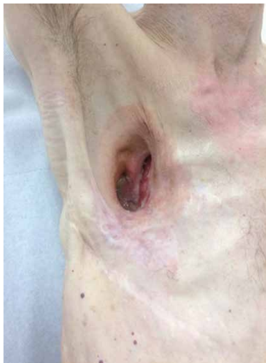
Figure 2. Patient's chest after myoplasty and recovery (29.08.2019)

ment strategies. These include closing the fistula, and eradication of the pleural empyema [3] followed by obliteration of the pleural space.