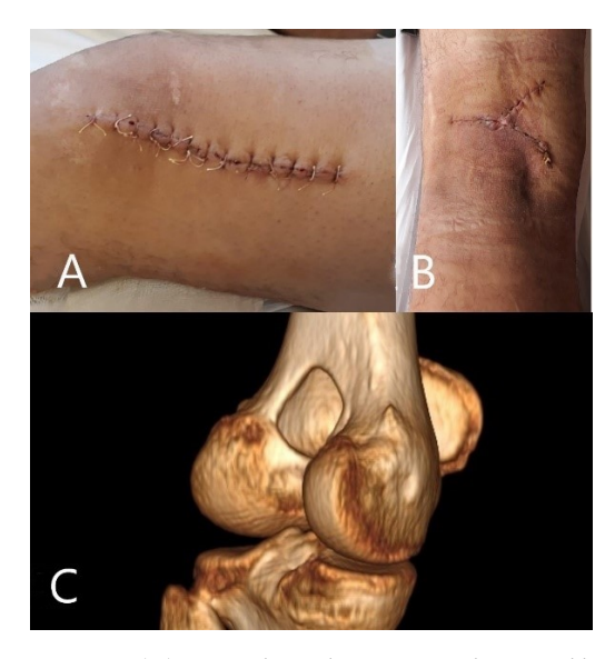
Figure 3. ( A ) Anterolateral incision with normal healing and no sign of septic complications. ( B ) Posterior scar used for soft tissue debridement. ( C ) CT reconstruction after surgery showing post-operative aspect with bone inducing cement filling the remaining bone defect.