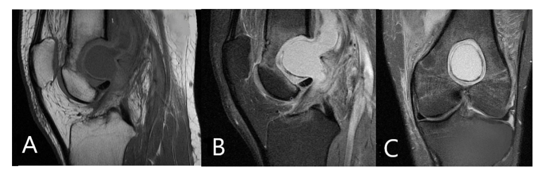
Figure 1. ( A ) T1 weighted MRI image demonstrating 'penumbra sign' described as perilesional lining of higher signal intensity, with a central hypo intense content. ( B ) Sagital plane image in fat suppression incidence showing extent of bone mass damage. ( C ) Frontal plane image also in fat suppression incidence demonstrating bone mass damage.

The MRI scan reveals the characteristic 'penumbra sign' that can be observed on T1 weighted images (Figure 1A) and consists of a higher signal intensity rim lining the main lesion, which is of a hypo intense signal on T1 weighted images [5–7]. The peripheral intensity is due to the vascularized granulation tissue and is characteristic of Brodie's abscess helping to differentiate the lesion from malignant tumors [5]. The 'penumbra sign' presents a sensitivity of 75% and specificity higher than 90% in the diagnosis of subacute osteomyelitis [5], and was an extremely useful imaging tool for reaching the final diagnosis. MRI study is especially important in the diagnosis of osteomyelitis because it can visualize bone edema and soft tissue spread of the disease [6], which is essential for correct pre-operative planning.