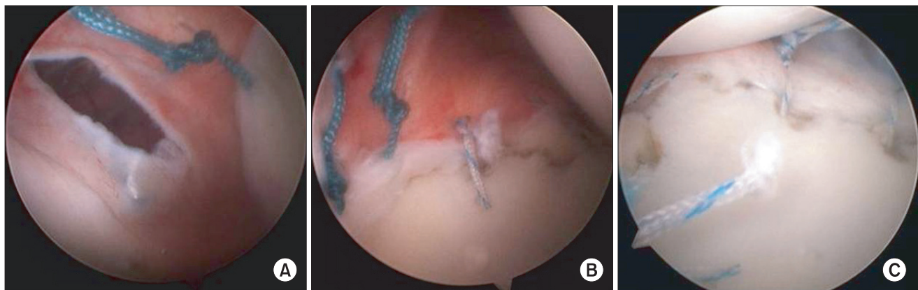
Fig. 3. The arthroscopic photograph shows complete suturing of the capsular plication (A), the antero-inferior labral repair (B), and the postero-inferior labral repair (C).

piercing the sac with a spinal needle. The remnant of the synovial sac was decompressed and debrided with an arthroscopic shaver. A punch biopsy of the synovial sac was performed. The arthroscopic findings showed a 2 × 1 cm multilobulated cyst at the antero-inferior labrum from