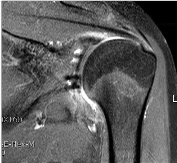
Fig. 4. The previously noted cyst is no longer seen on the postoperative follow-up MRI.

We debrided and detached the labral tear site completely and then arthroscopic anterior and posterior labroplasty was done with suture anchors (Smith & Nephew, Andover, MA, USA). Three anchors were initially used and these were inserted into the postero-inferior glenoid and then the posterior labral repair was done (Fig. 3A) Two more anchors were inserted into the antero-inferior glenoid and then labroplasty was done (Fig. 3B). Also, the capsular defect produced by the excisional procedure was repaired with #2 ethibond (Fig. 3C). Finally, inferior capsular plication and rotator interval closure were done with # 2.0 polydioxane sutures to augment the capsular redundancy. The drive-through sign disappeared after the operation. Pendulum exercise was started on postoperative one day. During the following six weeks, passive range of motion was continued and we kept the abduction brace on his shoulder. After six weeks, we started strengthening exercise for the rotator cuff muscles and the scapular stabilizing muscles. At postoperative 2 years, the patient has had pain-free shoulder motion and no further dislocation. Physical examination showed the sulcus sign (grade 1+), an anterior drawer test of grade 1+, a posterior drawer test of grade 1+ and a negative apprehension test. At the last follow-up, the Rowe score was 85 and the ASES/UCLA score was 98.5 and 33, respectively. The follow-up MRI showed complete resolution of the inferior paralabral cyst (Fig. 4).