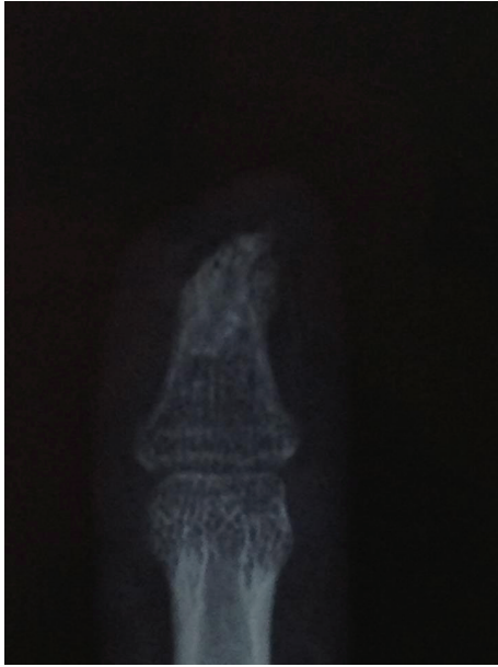
FIGURE 1: Erosion of the distal phalanx beneath the epithelioid sarcoma.

heal despite the repeated therapeutic efforts. An X-ray was performed (Figure 1) that showed the characteristic distortion and erosion of at least half of the distal phalanx beneath the dermal nodule. A partial biopsy of the subungual tissue was performed and it was sent to the Pathology Department of Evaggelimos Hospital.