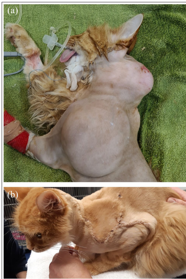
Figure 1 Gross appearance of the cutaneous xanthomas (a) preoperatively and (b) 2 weeks postoperatively

A board-certified internist experienced in ultrasonography performed ultrasounds of the abdomen and masses. The liver and spleen were normal in size, shape and echogenicity. The gallbladder was moderately distended, without distension of the common bile duct, and contained small amounts of gravity-dependent sediment. The kidneys were normal in size (left 4.6 cm and right 3.9 cm in length) and shape. The adrenal glands were normal in size (left 0.45 cm and right 0.42 cm at their respective caudal poles) and shape. The pancreas was mildly thickened (body 12.1 mm and pancreatic duct 2.0 mm in width), consistent with historical or chronic pancreatitis. The gastrointestinal tract was normal in thickness and layering. The jejunal and ileocolic lymph nodes were of normal size but were mildly hypoechoic and prominent. There was no abdominal free fluid. The cranial thoracic mass contained hypoechoic and thickened tissue consistent with cellulitis and oedema. Fine-needle aspiration (FNA) with a 22 G needle was non-productive. The dorsal cervical mass contained echogenic material. FNA yielded 60 ml of blood-tinged