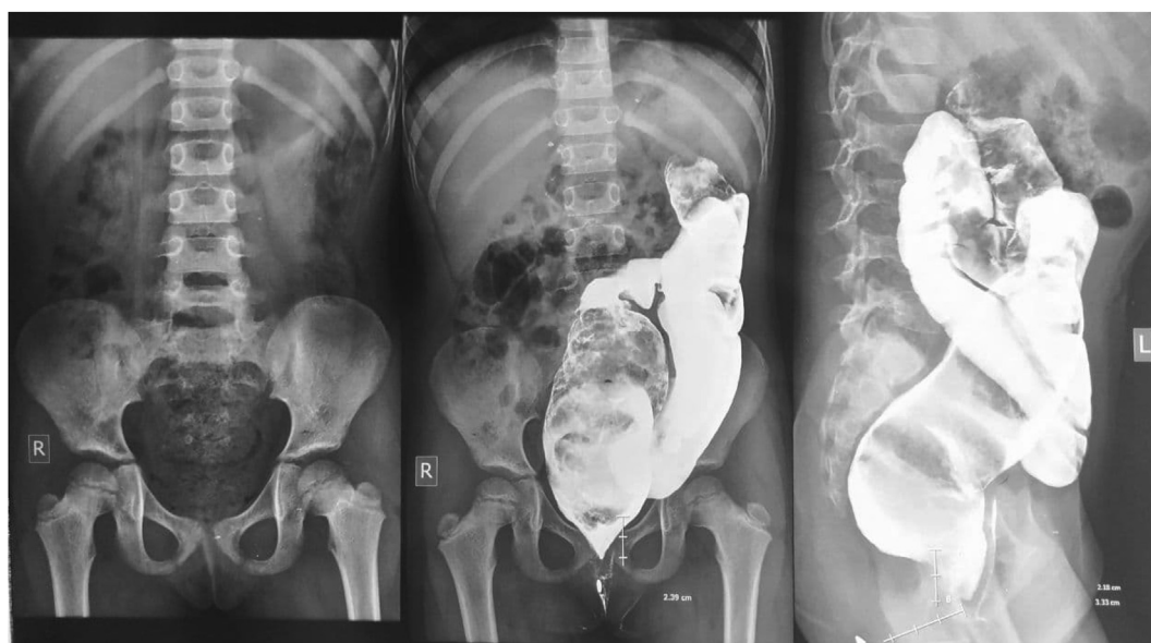
Figure 1: Preoperative contrast enema showing colonic dilatation proximal to the aganglionic colon.

After preoperative preparation, a definitive treatment was performed with Transanal Endorectal Pull-through (TEPT) surgery. The postoperative laboratory evaluation showed promising results. There were no signs of bleeding immediately after surgery. The rectal tube was postoperatively maintained for three days. After the procedure, the patient maintained took nothing by mouth for 24 h, followed by a gradual diet. Intravenous ceftriaxone 100 mg/kg/day was administered preoperatively up to five days postoperative. In addition, intravenous metronidazole at 10 mg/kg was given three times per day for five postoperative days. Postoperative pain was managed with intravenous paracetamol. Subsequent to an evaluation five days after surgery, the patient was discharged. Before discharge, an early postoperative