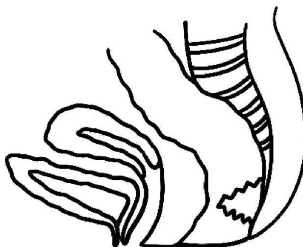
Figure 2: Dehiscence in the posterior side of the coloanal anastomosis.

A six-year-old girl came to the Paediatric Surgical Outpatient Polyclinic with the complaint of difficulty defecating since the age of four years. The patient had a bowel movement usually once a week. On physical examination, there was no abdominal distension or darm contour; however, faecaloma was palpable. Laboratory studies showed promising results. There was no anaemia or impaired coagulation function. Thyroid hormone examination also showed normal results, which ruled out the possibility of constipation due to hypothyroidism. There were no signs suggestive of diabetes or other systemic diseases. The contrast enema (CE) showed a short-segment Hirschsprung's appearance (Figure 1). A full-