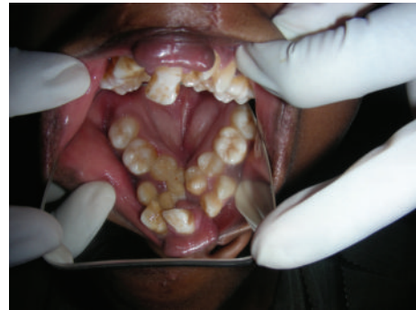
FIGURE 4: Collapsed high palatal arch.