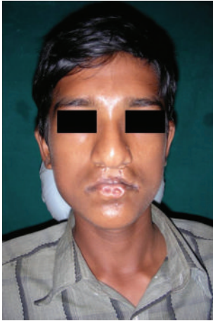
FIGURE 1: Frontal view of the patient showing midface retrusion and a repaired bilateral upper cleft lip.