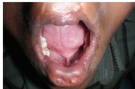
FIGURE 6: Ankyloglossia.