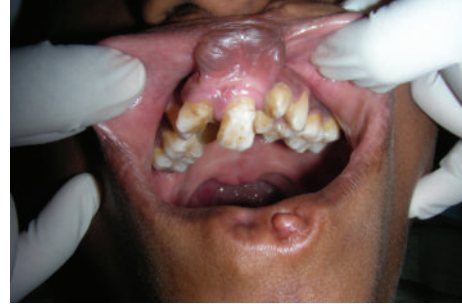
FIGURE 3: Crowding of teeth in upper arch along with fusion of the labial mucosa to the gingiva resulting in obliteration of labial vestibule.

The treatment planned for the patient was orthodontic treatment involving the correction of crowding of teeth and collapsed palatal arch along with cosmetic correction of