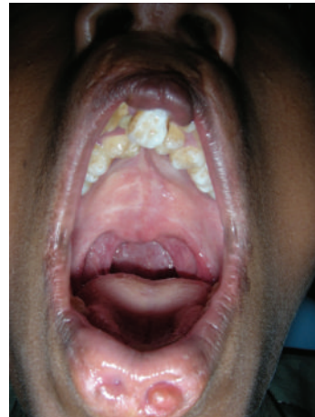
FIGURE 5: Short uvula.