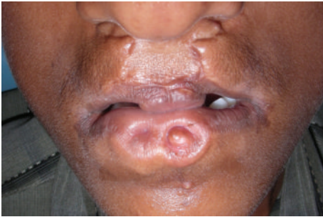
FIGURE 2: Close-up view showing two bilaterally symmetrical lip pits on the lower lip.

of his parents and none of the family members had cleft lip/palate. Detailed examination of the lip revealed bilateral lip pits with one pit present at the base of nipple-like elevation (Figure 2). These lip pits were 3 mm in diameter and 5 mm deep. When the lower lip was compressed, mucous secretion was expressed from one of the lip pits. Intraoral examination revealed collapsed V-shaped palate with severe upper anterior teeth crowding (Figures 3 and 4). There was obliteration of the upper labial vestibule due to the adhesion of the lip to the gingiva by a thick fibrous band which blanched on retraction of the upper lip. Patient presented with a short uvula (Figure 5). However, mandibular teeth were all present and well aligned along with presence of short lingual frenum causing ankyloglossia (Figure 6). Posterior crossbite was noted which was attributed to the presence of narrow and collapsed arch. General medical examination was performed to rule out presence of systemic problems. Radiographic investigations like chest radiograph, lateral cephalograph, orthopantomograph, and maxillary occlusal view were taken. Genetic studies were not performed as the patient's parents did not give consent for the same.