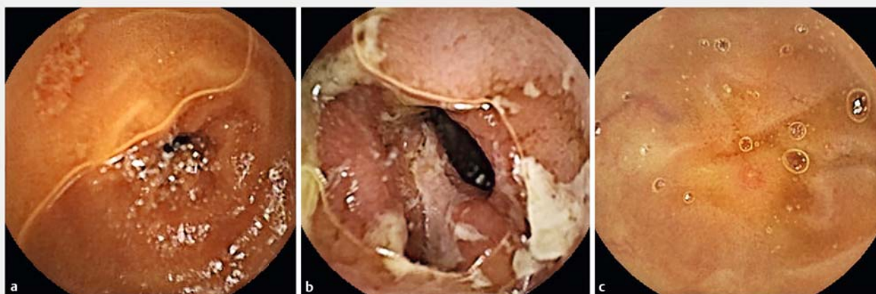
► Fig. 2 Intestinal abnormalities. a Ulcer. b Annular ulcer. c Erosion.