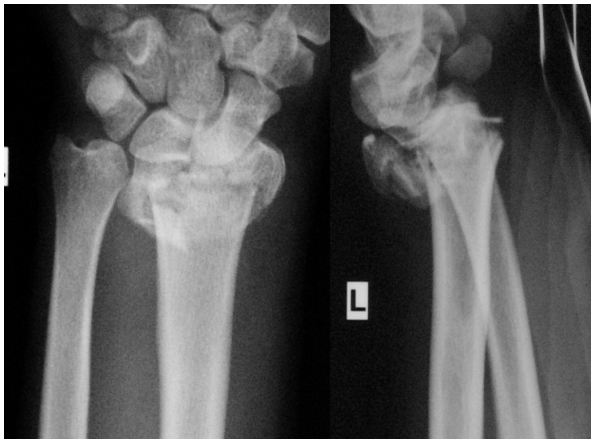
Figure 3 Illustrated case (preoperative radiographs). Complex multifragmentary fracture of the distal radius with dorsal tilt.

postoperatively and at 24 months for both groups 7.5^\circ (\pm 3.5/\text{range } 0-12) . Preoperative loss of radial length was 6.3 mm ( \pm 3.7/\text{range } 2-12 ) and was equal postoperatively and at 24 months ( 0.1 \text{ mm } (\pm 0.8/\text{range } 1 \text{ to } -2) ). Preoperative radial inclination was 10^\circ (\pm 7.2/\text{range } -6-22) and was equal postoperatively and at 24 months ( \pm 18.5^\circ (4/\text{range } 15-26) ). Results according to the Dresdner score are presented in table 1. Secondary dislocation between the postoperative position and the 24-month control was not observed in any patient. All fractures were partially consolidated after six weeks and completely consolidated after three months. One patient had evidence of osteoarthritic development on the 1- and 2-year radiograph.