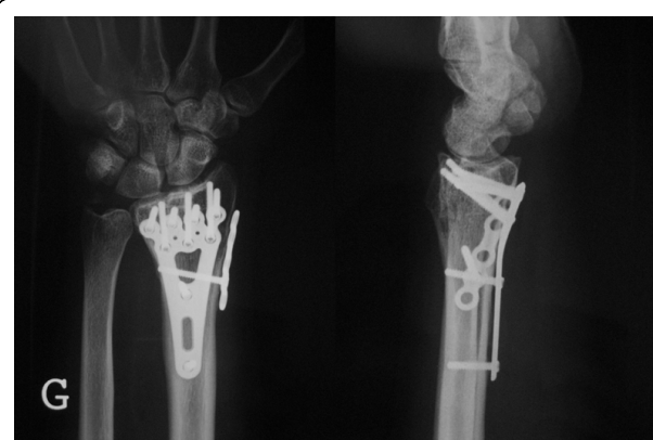
Figure 5 Illustrated case (postoperative radiographs). The fracture is anatomically reduced and stabilized.

present to allow a functional rehabilitation protocol, even in osteoporotic fractures. The mechanical strength of this double-plating technique is mainly provided by the volar plate, whereas the radial plate acts as a buttress plate holding the radial styloid fragments in place.