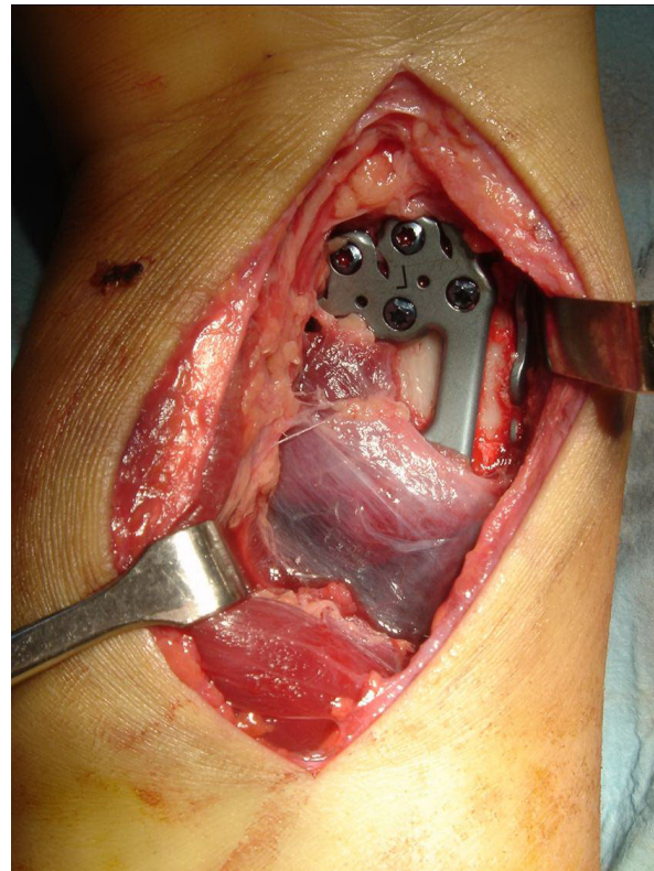
Figure 4 Illustrated case (surgery). Intraoperative image with partially detached pronator quadratus muscle over the volar plate. The radial plate is visible on the radial border of the radius. (the image has been flipped horizontally for better comparison with the X-ray).

The presented double plating technique, with the radial plate used as a buttress plate, is a very useful tool to reduce a displaced radial styloid fragment in the frontal plane, particularly in osteoporotic bone or if the styloid fracture is multifragmentary. In these cases, anatomic reduction without the support of the radial plate can be difficult. Secondary dislocation did not occur in any of our patients. Biomechanical data for this fixation are not available, but it seems that sufficient stability was