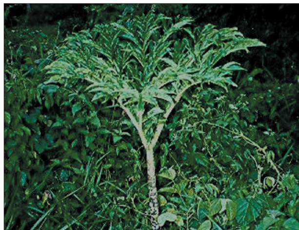
Figure 2: Plant of Amorphophallus paeoniifolius