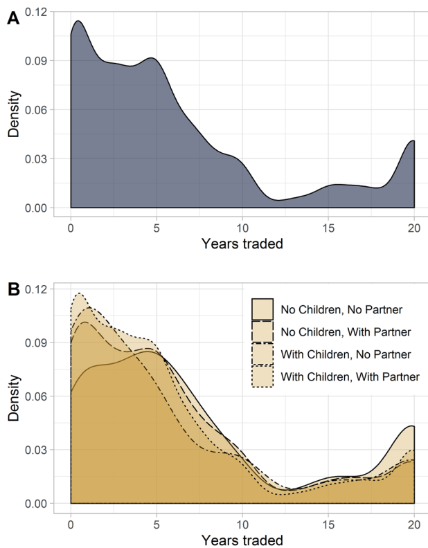
Fig. 1 Number of years traded per TTO task for (A) the total sample (B) subgroups with/without children and/or partner

observations were right-censored with a maximum disutility of 2. Respondents without significant others defined 22% of valuations as WTD (respondents with significant others: 15%). Logistic regression showed that those with a partner were less likely to value health states as WTD ( p < 0.05 ) (Supplementary Table 7).