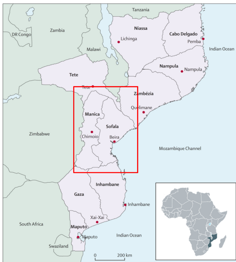
Figure 1 Map of Mozambique—provinces and provincial capitals [12].

In the central provinces of Sofala and Manica where the research is conducted, the provincial HIV prevalence rates of adults aged 15–49 years are among the highest in the country for women at 15.6% and 17.8%, respectively, and 14.8% and 12.6% for men [22]. The prevalence among pregnant women in 2009 was estimated at 18% [23,24]. HIV testing and treatment services in Manica