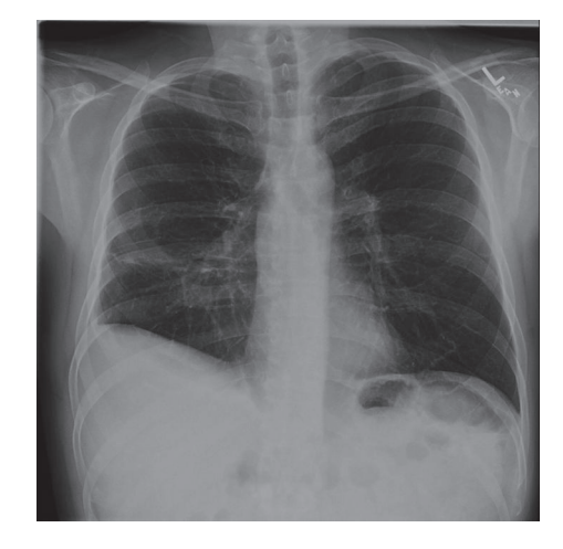
FIGURE 4: 4 months after hospital discharge.

On hospital day 10 he was weaned off of pressor support and underwent a tracheostomy and PEG placement. Patient continued to improve and was transitioned to tracheostomy collar by hospital day 13. Antibiotics were changed to Ampicillin/Sulbactam for the remainder of his hospital stay. Patient was discharged on hospital day 25 on Amoxicillin-clavulanate 875 mg/125 mg. On discharge he had one remaining chest tube on the right side, and there was a persistent bronchopleural fistula. Seven weeks after his initial presentation his chest tube was removed. His oral antibiotics were discontinued shortly thereafter. Chest X-ray was obtained four months after his hospital discharge (Figure 4).