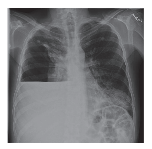
FIGURE 2: Chest X-ray after thoracentesis showing large right pneumothorax with collapse of the lung into the hilar region. Large right hemithorax air-fluid level. Increased airspace consolidation within the left lower lobe.

many Gram-positive rods resembling Lactobacilli. Cultures from the pleural fluid obtained during the VATS procedure grew Lactobacillus gasseri. Antibiotics were deescalated to piperacillin-tazobactam alone. Postoperatively his course was complicated by acute respiratory distress syndrome (ARDS) and repeated CT chest imaging showed left sided empyema and left lower lobe collapse (Figure 3) and a left chest tube was placed for drainage on hospital day 8. Left lung pleural fluid cultures also grew L. gasseri. The laboratory methods for the sputum culture and pleural fluid aerobic culture (from both right and left lung pleural fluid) were a send-out test to a larger teaching hospital that our community hospital is affiliated with. Both cultures were identified as GP bacilli, alpha colony, Lactobacillus gasseri susceptible to penicillin [1]. Pleural biopsy revealed reactive mesothelial cells and acute and chronic inflammation.