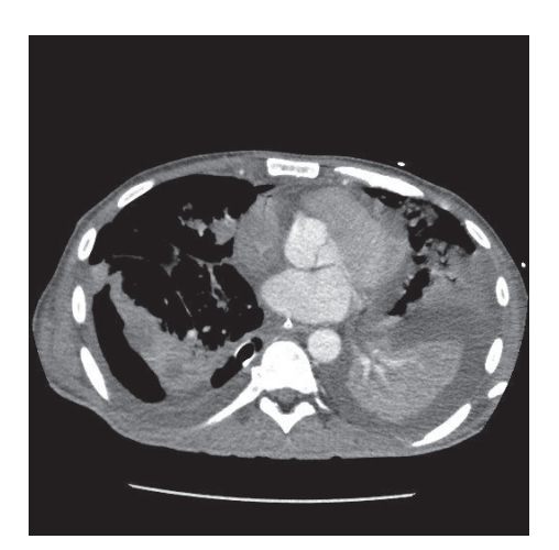
FIGURE 3: Left sided empyema and left lower lobe collapse prior to drainage.

many Gram-positive rods resembling Lactobacilli. Cultures from the pleural fluid obtained during the VATS procedure grew Lactobacillus gasseri. Antibiotics were deescalated to piperacillin-tazobactam alone. Postoperatively his course was complicated by acute respiratory distress syndrome (ARDS) and repeated CT chest imaging showed left sided empyema and left lower lobe collapse (Figure 3) and a left chest tube was placed for drainage on hospital day 8. Left lung pleural fluid cultures also grew L. gasseri. The laboratory methods for the sputum culture and pleural fluid aerobic culture (from both right and left lung pleural fluid) were a send-out test to a larger teaching hospital that our community hospital is affiliated with. Both cultures were identified as GP bacilli, alpha colony, Lactobacillus gasseri susceptible to penicillin [1]. Pleural biopsy revealed reactive mesothelial cells and acute and chronic inflammation.