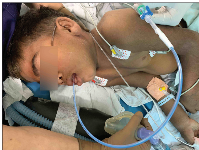
Figure 2: Postextubation image with airway exchange catheter in situ