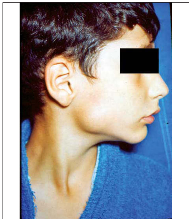
Figure 1. Parotid region bowing.

The pathological findings include pseudocystic dilations of interlobular ducts, periductal lymphocytic infiltration, interacinar fibrosis and many degrees of atrophy