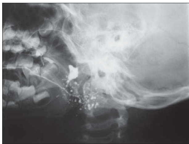
Figure 3. RRL Sialography (case 4) with saccular dilations in distal ramifications of left Stenon duct, compatible with chronic sialadenitis.

The number of inflammatory acute crises ranged from individual to individual, with episodes every three or four months, which was the most common pattern 1,10 . Mandel and Kaynar reported that crises tended to occur one to five times a year 8 . The frequency of episodes is normally higher in the first school year and tends to gradually reduce up to puberty. After puberty, symptoms are usually scarce and vanish completely 1,10 . In our sample, we found increase in