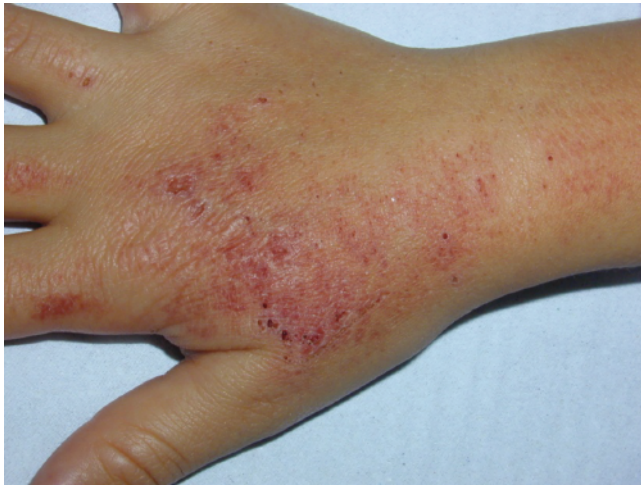
Figure 1. Intense painful lesions on the right hand of the patient.

showed the deletion of the entire FECH-gene on one allele, while on the other allele was found an intronic variant, which is classified in the literature as a susceptibility polymorphism: c.315-48T>C (IVS3-48T>C). Our patient underwent an afamelanotide – an \alpha -melanocyte-stimulating hormone analog – implant in June