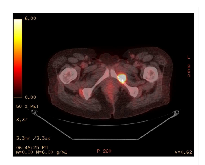
FIGURE 1 | Positron emission tomography/computed tomography of the pelvis showed a hypermetabolic lytic lesion with a pathologic fracture involving the left inferior pubic ramus with maximum SUV 15.1 associated with a soft tissue mass 2.5 cm. x 1.8 cm.