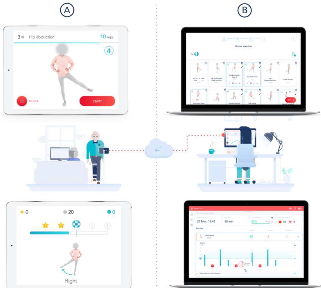
Figure 1. System components. (A) Mobile app. Preparation screen (top left): this screen displays video and audio instructions for each exercise. Execution screen (bottom left). (B) Web portal. Prescription screen (top right) displaying the exercise list and session layout. Results screen (bottom right) presenting (1) date, time, and session duration; (2) pain and fatigue scores; and (3) information on each repetition-range of motion and movement errors.

The system consisted of the elements described subsequently (Figure 1).