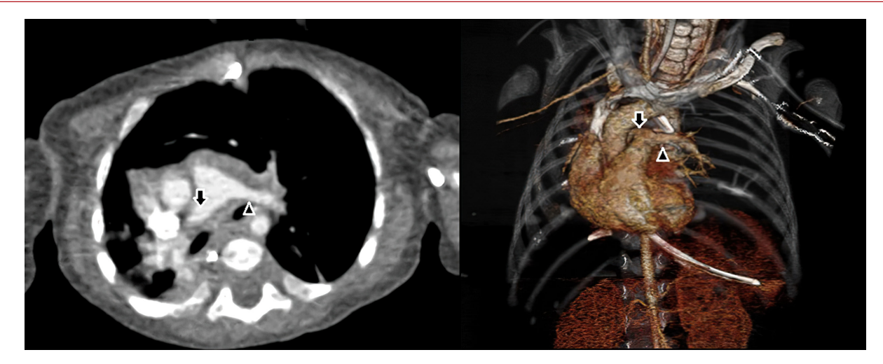
Figure 3. The postoperative control CT images showing normal branches of the pulmonary trunk (arrowhead: left PA, black arrow: right PA).

diagnosis with TTE, additional imaging methods are needed to confirm this diagnosis. This additional imaging method may assist the need for bronchoscopy, barium esophagography, magnetic resonance imaging (MRI) and CT examinations. Bronchoscopy examination is useful in determining the location and extent of tracheal stenosis. However, MRI and CT examinations are valuable in terms of visualizing both vascular and other structures and making an accurate surgery plan. In such cases, our clinical preference is generally in favor of CT. Although MRI is avoided from the contrast material caused by tomography and the harmful effects of radiation, it may not be suitable for every patient because of the long duration of the examination, its being expensive and requiring sedation. In addition, CT imaging outputs are completed in a short time, and the radiation doses decreasing to low levels due to the advances in the technology of the devices are the prominent aspects of this examination.