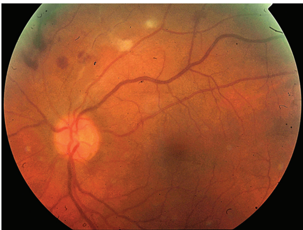
Figure 1a: Left eye fundal images showing retinal hemorrhages and cotton wool spots along the superior temporal arcade

To our knowledge, the association between PSC and uveitis has been reported once previously. In this case series of six patients, a postulated relationship between uveitis and PSC is demonstrated. All identified patients in their cohort had a history of bowel and/or musculoskeletal disease. They identified only one case of unilateral panuveitis involving the retina in a male patient aged 51 years. [2] Of these cases, four demonstrate unilateral inflammation. Five cases report an