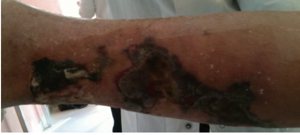
FIGURE 1: Extensive skin necrosis of the lower limb.

The previous medical history was unremarkable for cardiovascular risk factor or underlying vascular disease.