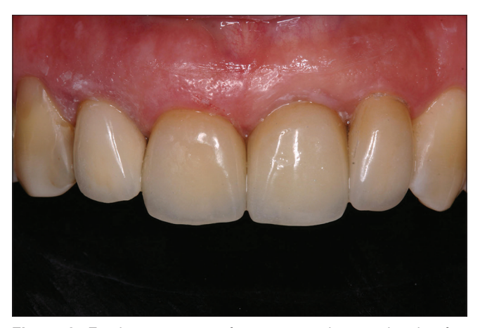
Figure 8: Final appearance of anterior teeth immediately after cementation

impression using prefabricated components does not necessarily reproduce the anatomical structure; hence, the emergence profile created is not ideal.<sup>[9]</sup>