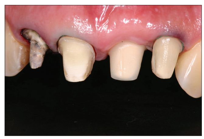
Figure 7: Teeth prepared and abutment positioned

It also promotes good esthetic outcomes. This is especially important when the use of provisional crowns is required by the impossibility of immediate loading of the implant.<sup>[8]</sup>