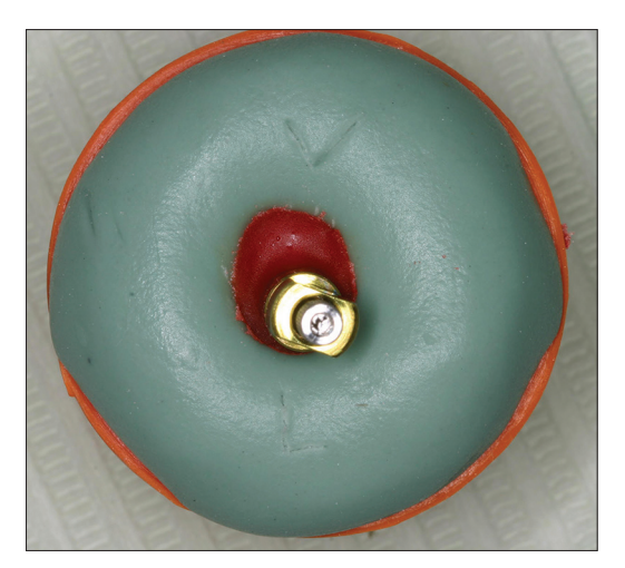
Figure 4: Customization of the transferor with acrylic resin: Filling the subgingival portion occupied by the crown with red acrylic resin