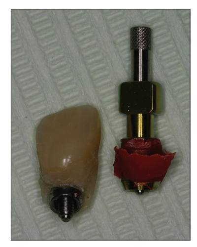
Figure 5: Customization of the transferor with acrylic resin: Result after the setting of the acrylic resin

The installation of well-positioned temporary crowns by following the procedures established by David<sup>[7]</sup> can facilitate the installation of permanent crowns because it ensures the appropriate conditioning of the gingiva.