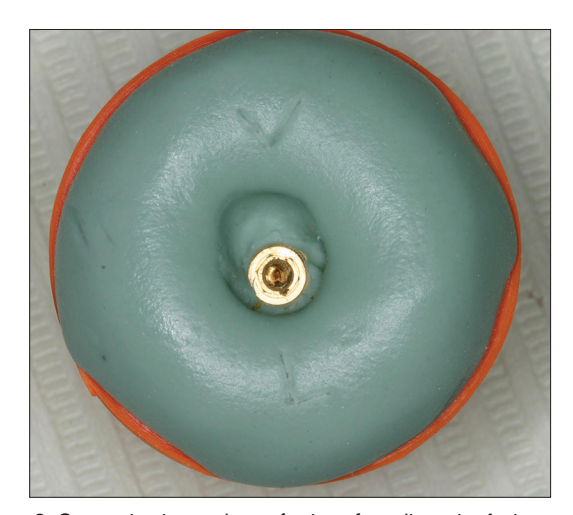
Figure 3: Customization and transferring of acrylic resin: An impression of the coronary profile with condensation silicone

The upper left central incisor received a customized abutment [Figure 7], which replaced the temporary crown originally installed. The crown was manufactured with Lava zirconia ceramic system (3M ESPE, St. Paul, MN, USA). The other prostheses were made with IPS e.max Press ceramic system (Ivoclar Vivadent, Barueri, SP, Brazil)