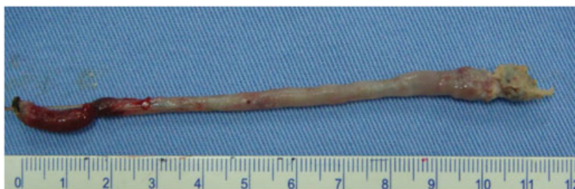
Fig. 3 Macroscopic view of the polyp.

Obviously, a definitive diagnosis is accomplished only by histopathologic evaluation. Histologically, FVPs present a mixture of fibrous elements, adipose tissue, and blood vessels, surrounded by normal squamous epithelium. 5