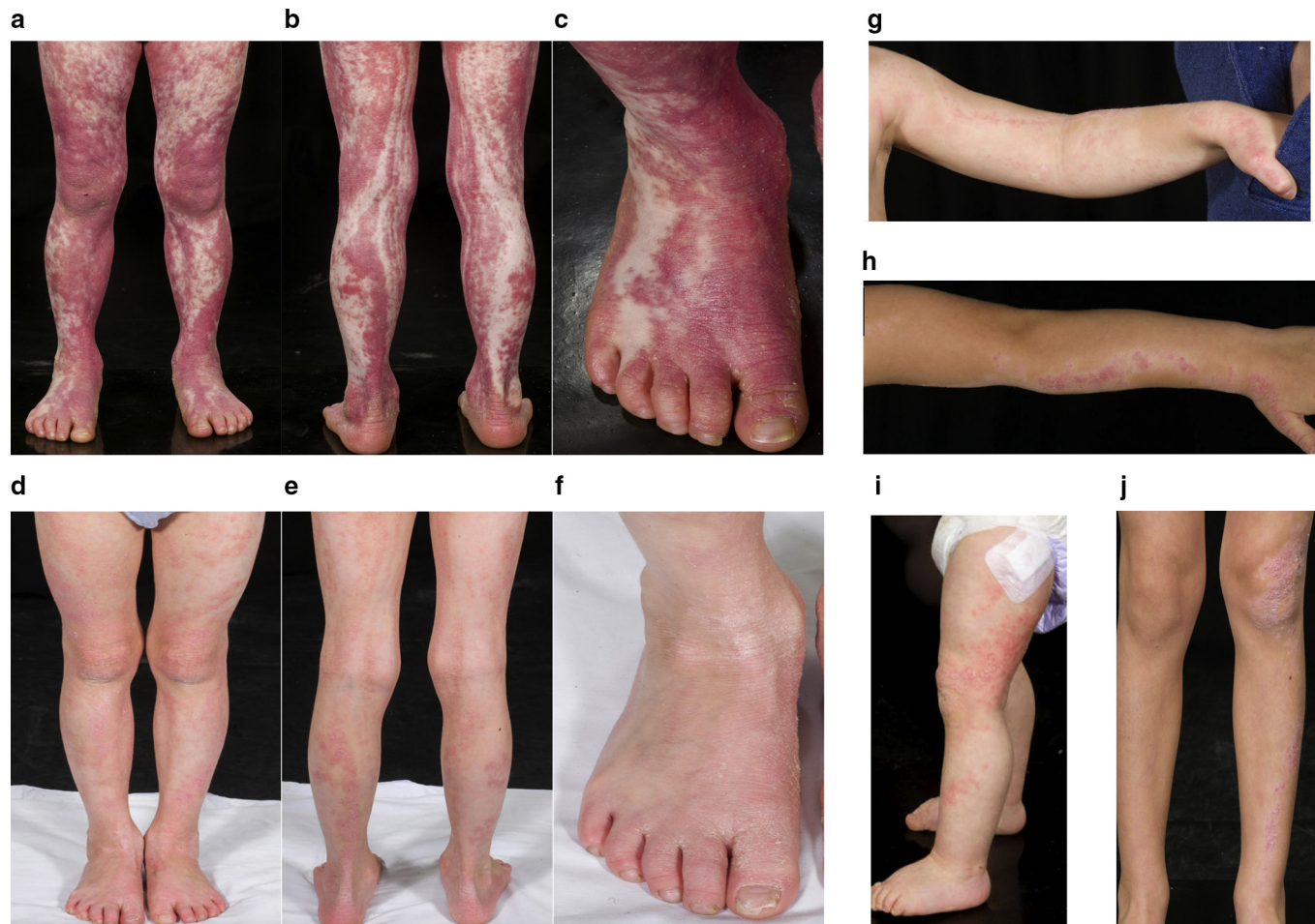
Figure 1. Clinical features of CARD14 mosaic ILVEN and dramatic response to targeted therapy in one patient. Patient 1 pre-treatment (a–c) and 3 months post commencing Ustekinumab (d–f), showing dramatic reduction in erythema and hyperkeratosis. Patient 2 pre-treatment showing predominantly left-sided Blaschko-linear inflammatory and hyperkeratotic skin lesions at 1 year (g, i) and 4 years (h, j). The patients’ parents/guardians consented to the publication of the patients’ images.

cells transfected with the wild-type CARD14 construct (Figure 2h). This was further validated at the protein level by IL-12/IL-23 p40 ELISA (Figure 2m and n) (Invitrogen, Waltham, CA). In addition, WST-1 assay (Sigma-Aldrich, St. Louis, MO) showed a significant increase in proliferation rate in patient KCs and SVK 14 cells transfected with the mutant CARD14 construct (Figure 2i and j). A significant increase in NF-κB p65 subunit activity was shown by ELISA in nuclear extracts from SVK 14 cells transfected with the mutant CARD14 construct (Figure 2l) but not in patient KC nuclear extracts (Figure 2k) (Abcam, Cambridge, United Kingdom), potentially owing to the less physiological model of overexpression in the cell line model.