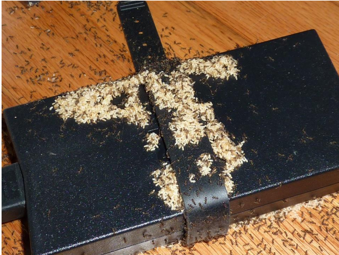
Figure 1. During cool winter weather in Georgia (USA) (October through March), Argentine ants routinely move indoors [37]. In this image, on a cool October evening in Georgia, Argentine ants located and recruited to a warm computer battery charger located indoors, where grams of brood were relocated.

about invasions by Argentine ants that week. Ant invasions were most prevalent during the winter months when the weather was cold and wet. A similar phenomenon occurs in the Southeastern U.S. during the winter when ants move indoors during cold weather (Figure 1).