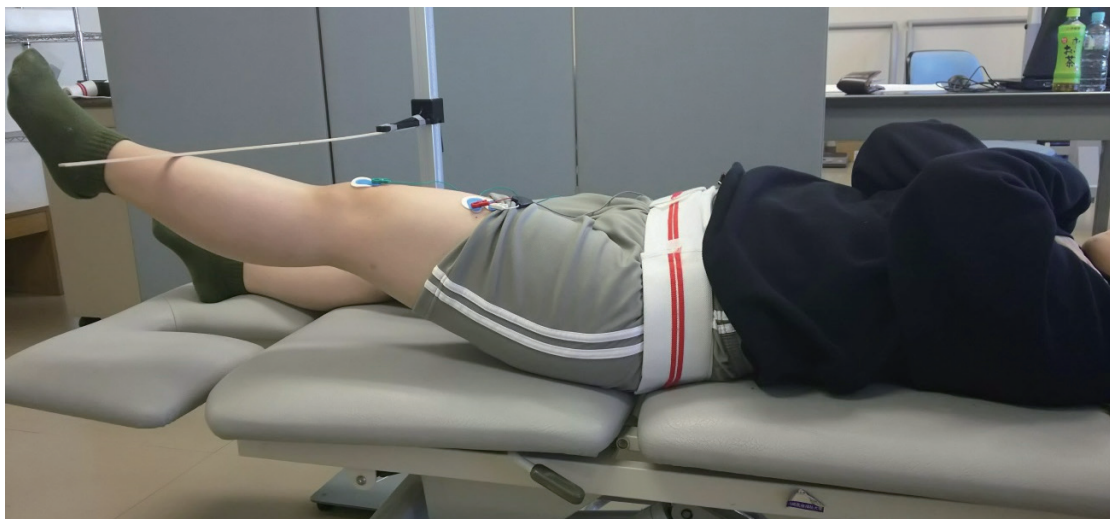
Fig. 1. The subjects raised their leg of the subjective heavier side until their leg touched the indicating bar, which was placed 20 cm above the bed while keeping the knee extended. The presentation of this figure was approved by the participant.

Initially, the subjects performed ASLR on the left and right legs and decided which leg felt the heaviest. Subjects performed the ASLR using the leg of the subjective heavier side in this study. ASLR was performed under two conditions: without a pelvic belt and with a pelvic belt. The pelvic belt (COM-PRESSOR, OPTP Co., Minneapolis, MN, USA), which consists of four elastic bands and a main body belt, was placed below the anterior superior iliac spine (ASIS) (Jung et al., 2013). For performing ASLR, subjects