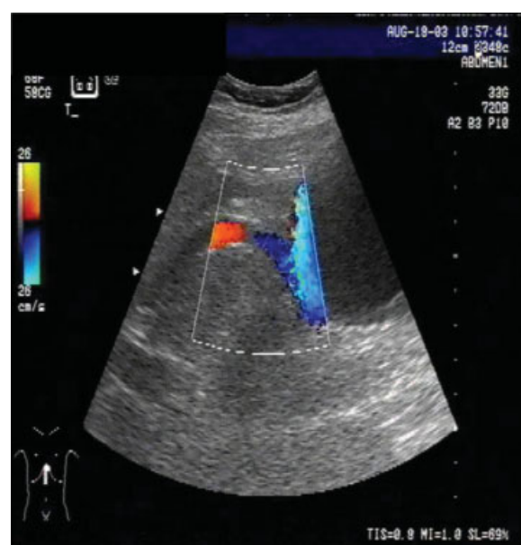
Fig. 2 In the power Doppler mode, the superficial abdominal varices are clearly visible.

approach inappropriate. As a result, a team of gastroenterologists, surgeons, and interventional radiologists met to discuss the most appropriate procedure. In the light of the patient's elevated bilirubin levels (6.9 mg/dL), and fearing the spontaneous rupture of the aneurysm, the decision was taken to lower portal pressure. The implantation of a transjugular intrahepatic portosystemic shunt (TIPS; →Fig. 3a, b) seemed to be the least invasive option. Apart from thrombocytopenia and elevated bilirubin, contraindications for TIPS implantation (hepatic encephalopathy, portal thrombosis, heart insufficiency, pulmonal hypertension, etc.) could be ruled out.