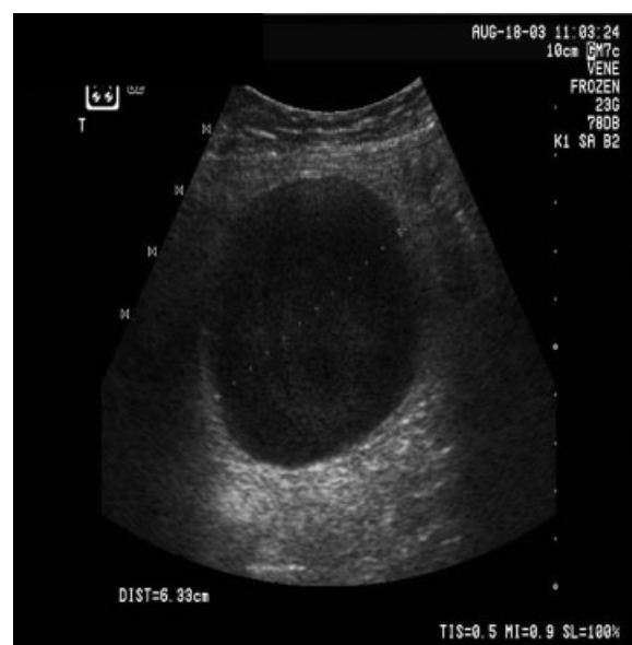
Fig. 1 Under ultrasound examination, an echo-poor formation can be identified as a vessel.

Treatment of the aneurysm was indicated due to the patient's unstable social environment, which put her at risk of recurrent blunt traumata and potentially fatal bleeding. Voluminous abdominal wall collaterals made a laparoscopic