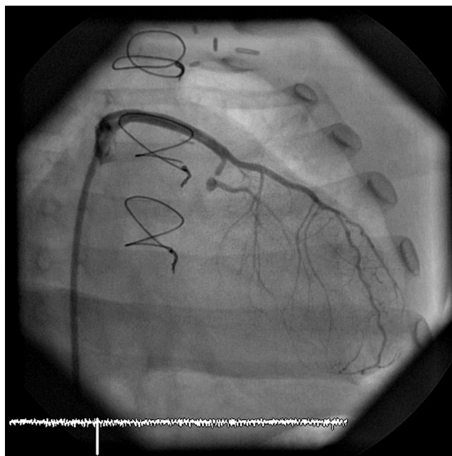
Fig. 2 – The angiographic appearance of the subclavian to LAD anastomoses in patient 2. There is a suspicion of angulation and kink at the level of the anastomosis. The perfusion scan revealed no perfusion defect.