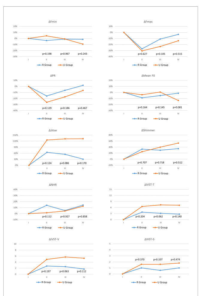
FIGURE 2 | Voice parameter changes ( \Delta ) with different vocal cord movement (VFM) outcomes: R Group (Blue line) and U Group (Red line). Fmax, Maximum pitch frequency; Fmin, Minimum pitch frequency; PR, Pitch range; Mean F0, mean fundamental frequency; NHR, noise-to-harmonic ratio; IVST, Index of Voice and Swallowing Handicap of Thyroidectomy; IVST-T, Total IVST score; IVST-V, IVST score of voice domain score; IVST-S, IVST score of swallowing domain. period I, Preoperative period (within 2 months before surgery); period II, Immediate postoperative period (median duration of 3 days; range of 1-7 days); period III, Short-term postoperative period (median duration of 12 days; range of 7-30 days); period IV, Long-term postoperative period (median duration of 40 days, range of 30-90 days). The equation for calculating postoperative change in objective voice analysis (Fmax, Fmin, PR, Mean FO, Jitter, Shimmer, NHR) data was \Delta = (B - A)/A , the unit is %; the equation for calculating postoperative change in subjective voice analysis (IVST-T, IVST-V, IVST-S) data was \Delta = B – A, the unit is score. Where A and B are preoperative and postoperative values, respectively. The preoperative \Delta is 0 in all the voice parameter, p value <0.05, showed significant difference.

U2 groups; \Delta Jitter and \Delta Shimmer were larger in U2 Group compared to U1 Group. In period-IV, \Delta PR (p=0.006) also significantly differed between groups; \Delta Fmax, \Delta Jitter, and \Delta Shimmer were larger in U2 Group compared to U1 Group.