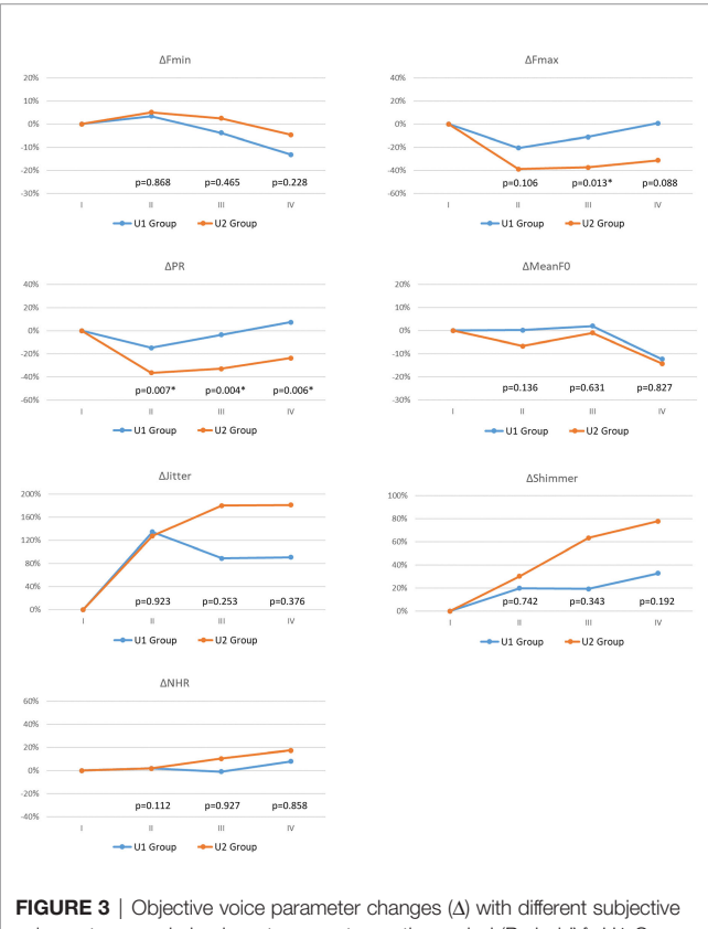
voice outcomes during long-term postoperative period (Period-IV): U1 Group (Blue line, \Delta IVST-T < 4 during Period-IV) and U2 Group (Red line, \Delta IVST-T > 4 during Period-IV). The abbreviations of objective/subjective voice parameters, the definition of follow-up periods (I/II/III/V), and the equation for calculating postoperative change in objective voice analysis are same in Figure 2 . The preoperative \Delta is 0 in all the voice parameter. p value <0.05, showed significant difference.

among the most common complaints (38). Since objective voice recording method was used in the current study, loudness adjustments were made during recording, which limited objective assessments of loudness changes. Such changes could only be represented by IVST scores.