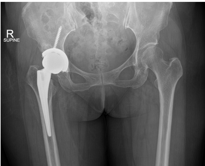
Figure 2. Postoperative radiograph of the patient, both hip AP.

scan showed complete occlusion of the right femoral artery. A vascular surgeon was consulted immediately, and the decision was made to perform emergency right femoral thromboemblectomy and prophylactic fasciotomy of the right leg. The intraoperative findings revealed a tear in the tunica adventitia of the anterior wall of the common femoral artery (Fig. 3). No complete rupture was detected. After the right femoral artery was exposed, intimal tear of the posterior wall was observed. A thrombus that extended to the anterior and posterior tibial arteries was removed (Fig. 4). The femoral artery was examined, and the artery had no atherosclerosis. The vessel was recanalized, and good blood flow was established. Her distal pulses were all palpable postoperatively. The fasciotomy site was closed at 2 weeks after thromboemblectomy. Her leg numbness and weakness gradually improved during the first 3 months after thromboemblectomy surgery. At the 6-month follow-up, our patient had good function of her hip with full recovery of motor power, but she reported continued numbness at the lateral side of her right leg.