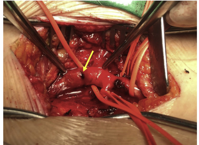
Figure 3. Intraoperative photograph shows the site of tunica adventitia tear of anterior wall of right common femoral artery (arrow).