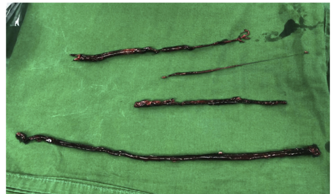
Figure 4. Intraoperative photograph shows removed thrombus that extended from common femoral artery down to anterior and posterior tibial arteries.

Vascular injury can cause hemorrhagic or ischemic symptoms. Our patient presented with ischemic symptoms, including paresthesia and paralysis of lower extremity. In the early postoperative period, these symptoms can mimic postregional anesthesia or intraoperative sciatic nerve injury. Calligaro et al. [6] reported that 56% of arterial injury was detected on the day of surgery and that 44% of arterial injury was not recognized until the first to fifth postoperative day after joint replacement. Thus, early diagnosis is the most essential factor for preventing catastrophic complication that could lead to compartment syndrome or requirement for limb amputation. Lazarides et al. [2] reported the consequences of