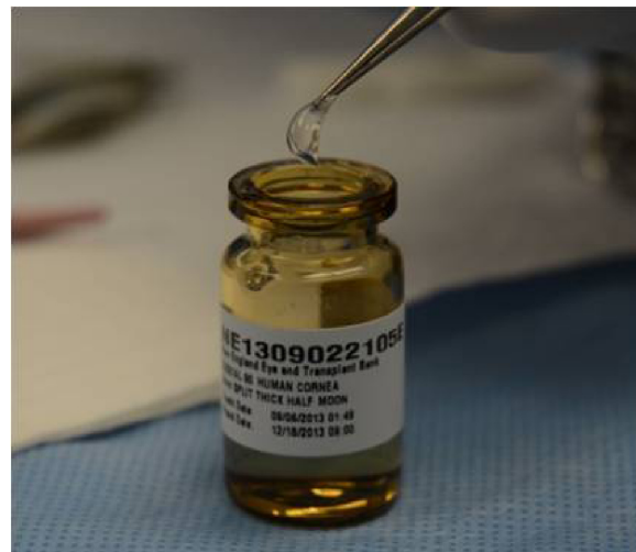
Figure 1 Gamma-irradiated cornea allograft.

A total of 169 eyes from 165 patients (71 male, 94 female) were included in this study. Mean age was 69.5 \pm 16.5 (ranging from 15 to 99) years. Patients' demographic data are