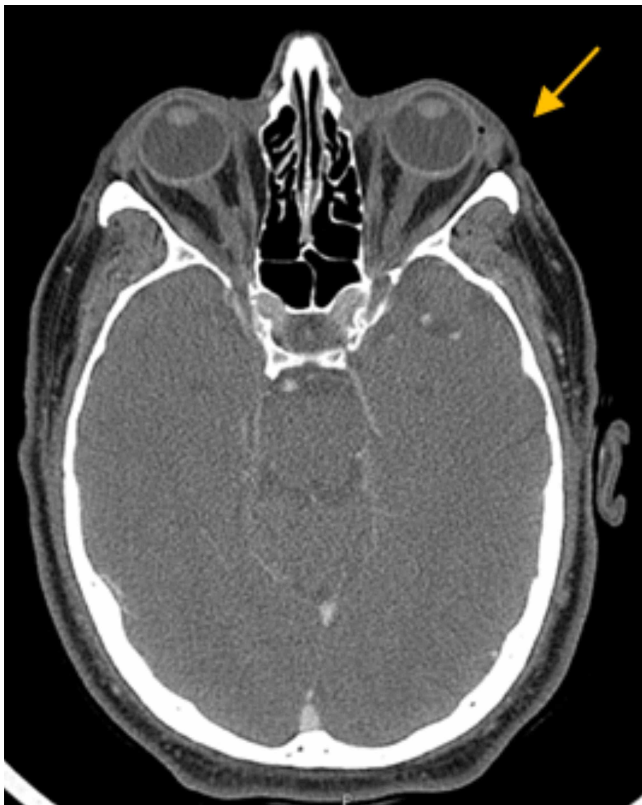
FIGURE 2: CT facial bones with contrast showing left-sided pre-septal cellulitis and probable subdermal fluid collection (yellow arrow)