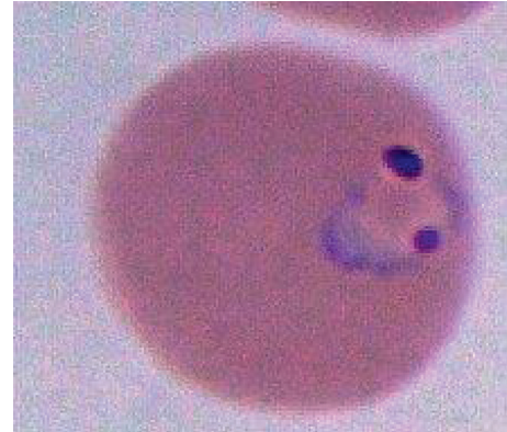
FIGURE 1: Enlarged picture of a ring-form trophozoite of Plasmodium falciparum .