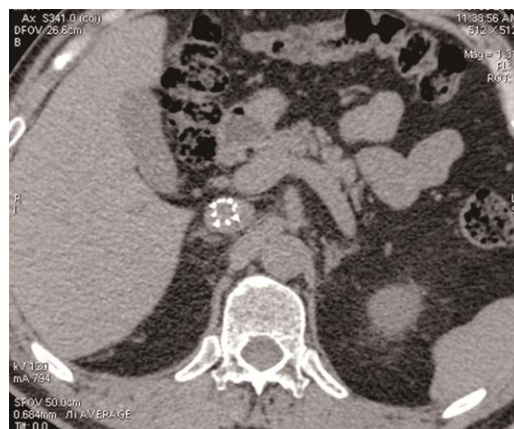
Figure 7. Retroperitoneal hematoma disappear at 6 months.

Leonardi et al. reported the treatment of retroperitoneal hematoma by surgery. However, the mortality rate of surgery was high, and there was no long-term follow-up information (13). In this case, we found that the retroperitoneal hematoma was caused by the perforation of IVC filter other than anticoagulant or thrombolysis, because INR was in the normal range during thrombolytic treatment. In this