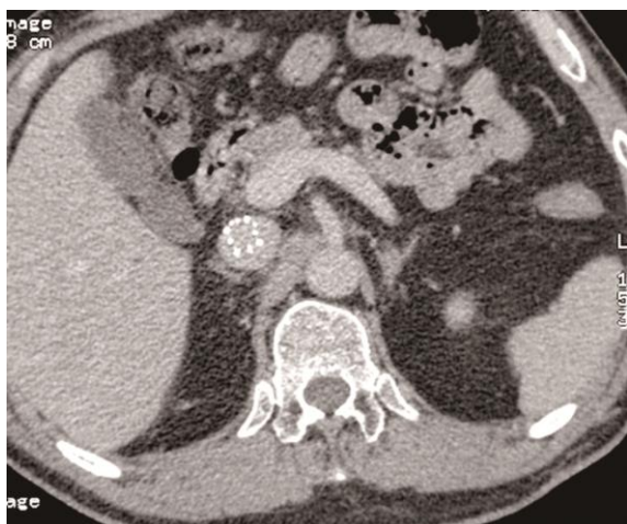
Figure 6. Further shrinkage of retroperitoneal hematoma 3 months after discharge.

presented on the sixth day after the filter implantation. It has been suggested that placement of a filter in the suprarenal position of the IVC may lead to penetration of the IVC wall as a result of respiratory motion and cardiac and aortic pulsation (10). Others have suggested that the risk of penetration is greater in a smaller IVC (12). Our patient may have had both of these risk factors.