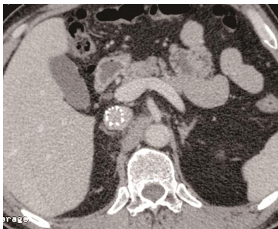
Figure 5. Retroperitoneal hematoma absorbed gradually 2 months after discharge.