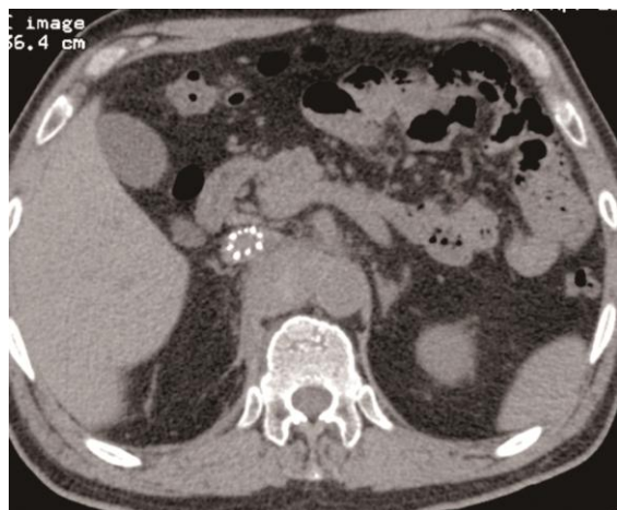
Figure 3. Retroperitoneal hematoma along with the struts of filter.