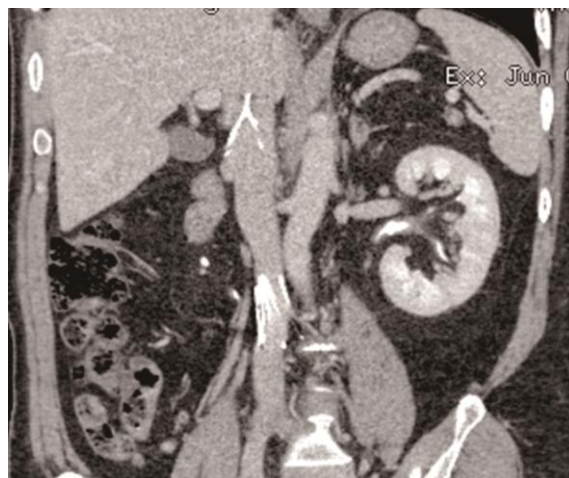
Figure 8. Unobstructed vena cava and no recurrent thrombus.

way, the possibility of retroperitoneal hemorrhage induced by thrombolysis or anticoagulant was excluded. Although the filter retrieval attempts were unsuccessful due to filter tilt, the patient completely recovered by conservative treatment. Post-operation abdominal CT scans at 2, 3, and 6 months showed that there was no evidence of recurrent thrombus, and the hematoma was gradually absorbed.