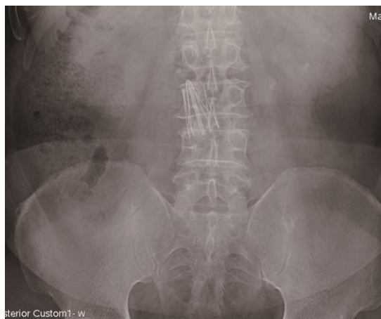
Figure 1. Abdominal X-ray showing permanent inferior vena cava filter.