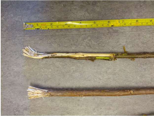
Fig. 2. A serviceberry tree shoot (above) collected and modified for use as a probe tool by a chimpanzee. Also shown for comparison (below) is a poplar stick, provisioned to the chimpanzees by keeper staff, also modified for use as a probe tool. NB: This photograph was taken of tools modified by this same group of chimpanzees in 2014, ten years after the data presented herein were collected.

were collected on 35 of these 56 days (i.e. Monday–Friday every week) from June 7th 2004–August 2nd 2004. These Baseline sessions were spread evenly throughout the Baseline period and all Baseline sessions were filmed for later analysis. During this period, the termite mound was never baited with food. The chimpanzees had no prior experience with obtaining food from this artificial mound and so this period represented a true behavioral baseline (see Lonsdorf et al. [2009] for full details of the chimpanzees’ background experiences).