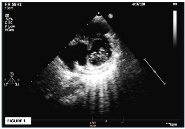
Figure 1: Parasternal short axis view at mitral valve level demonstrating a large aneurysmal sac on left of image with echo dropout at inferior septum.

post-operative course was uneventful and the boy got discharged in a healthy condition. He is currently in follow-up for the last 2 years and is asymptomatic.