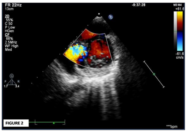
Figure 2: Parasternal short axis view at mitral valve level demonstrates communication between aneurysmal sac and left ventricular cavity on color flow.